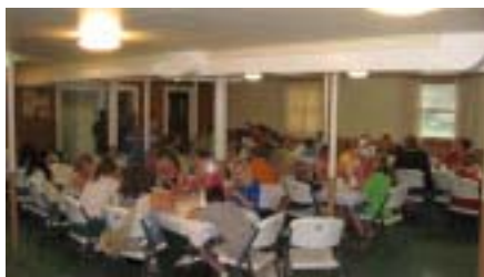
Club enjoying pizza party provided by Gleaners South Fairfield Arbor

Goats and "Udder Things held their seventh meeting on June 7 th at the Richfield Township hall. The Gleaners South Fairfield Arbor provided a pizza party for the club that was enjoyed by all. Thank you Gleaners for your continued support! Several members completed their demonstrations at the meeting which is required prior to the fair. Various animal clinics are scheduled throughout July as the club continues to prepare for the fair. Many of our members are getting ready to pack their bags and gearing up to attend 4-H Camp Palmer from June 16 – 20. This is an exciting time for many of the campers and counselors as they look forward to the many adventures that Camp Palmer has to offer. The next meeting will be held prior to the Delta Parade on July 12 th where the club will continue with its tradition by participating in the parade with a float.